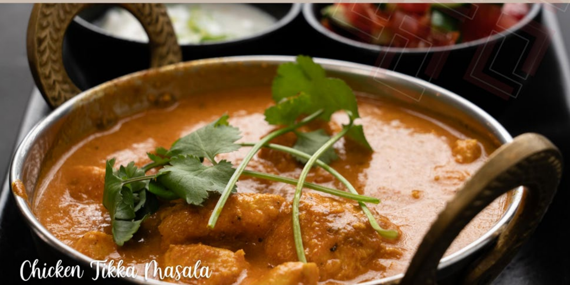
Chicken Tikka Masala