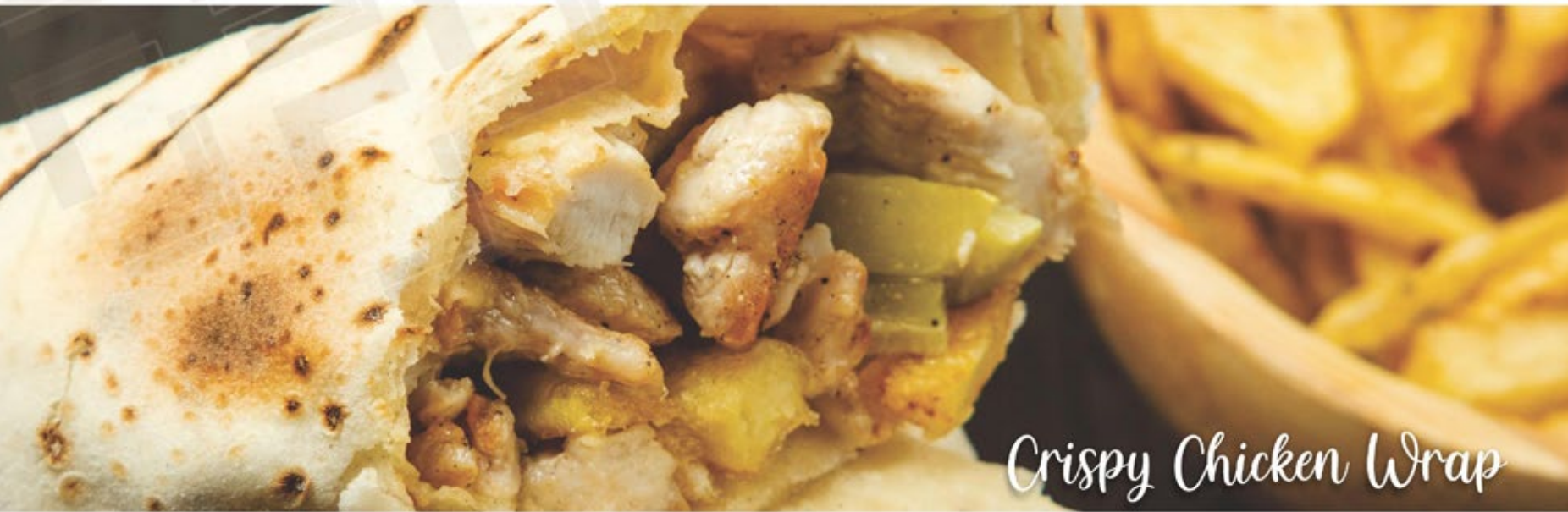
Crispy Chicken Wrap

Julienne veggies, light soy sauce and cashew nuts. Served with rice. Add chicken - R137