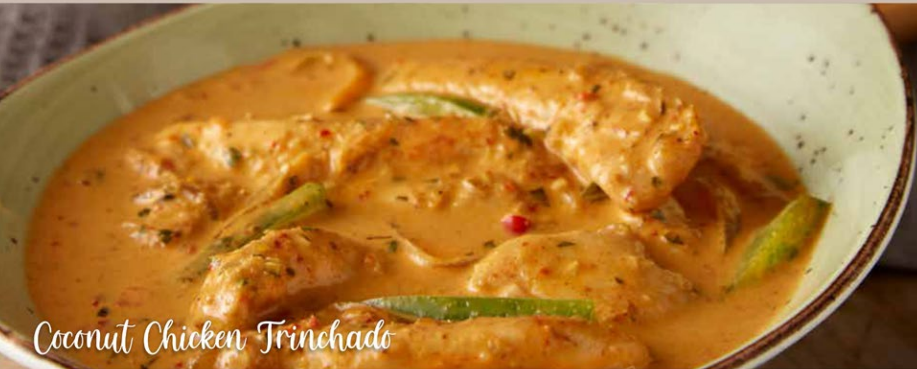
Coconut Chicken Trinchado