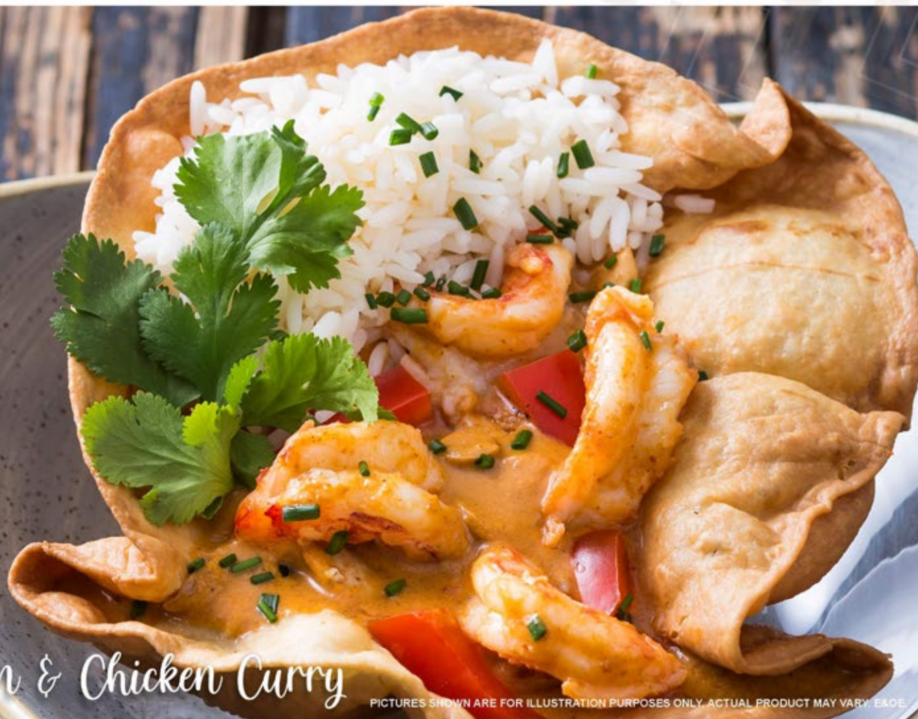
Prawn & Chicken Curry

200g Sirloin finished with sun-dried tomato and paprika butter. Served with avocado, prawns and chips.