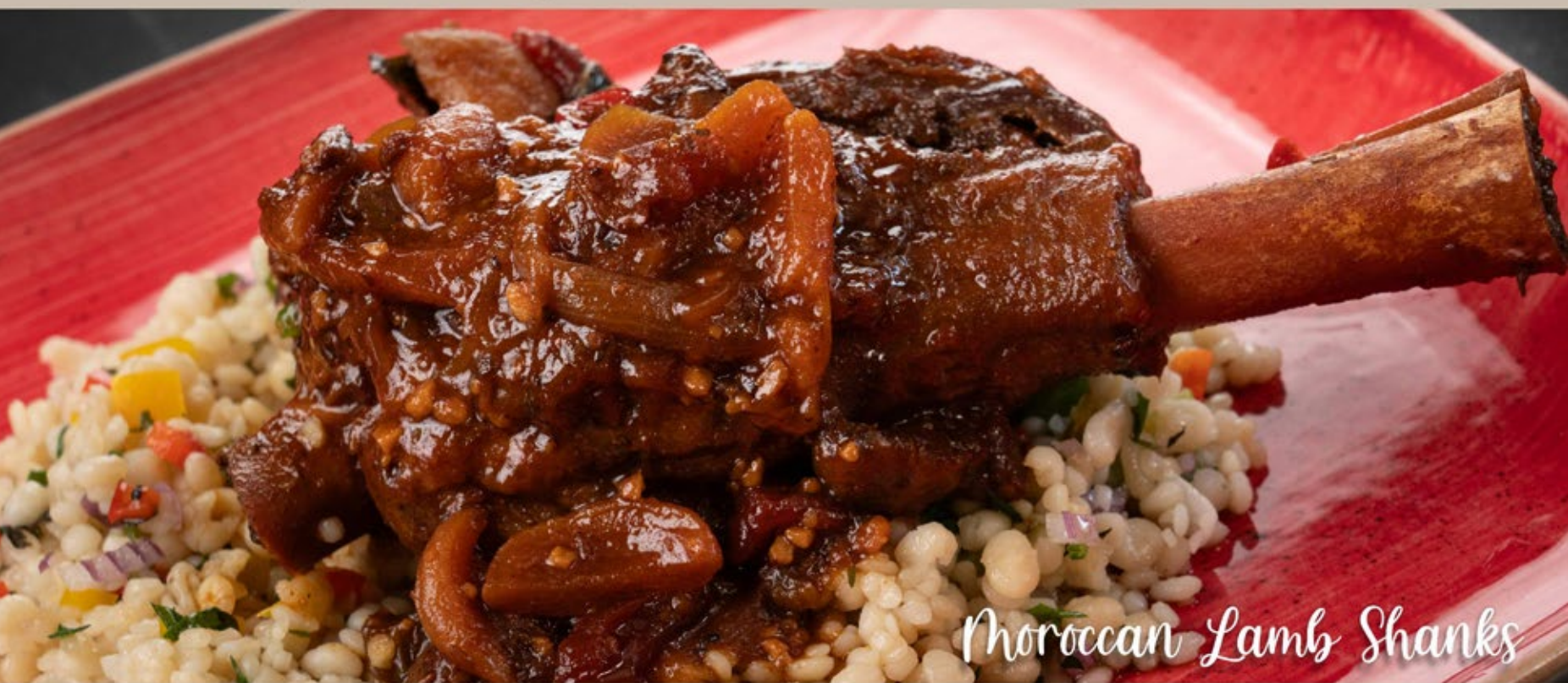
Moroccan Lamb Shanks