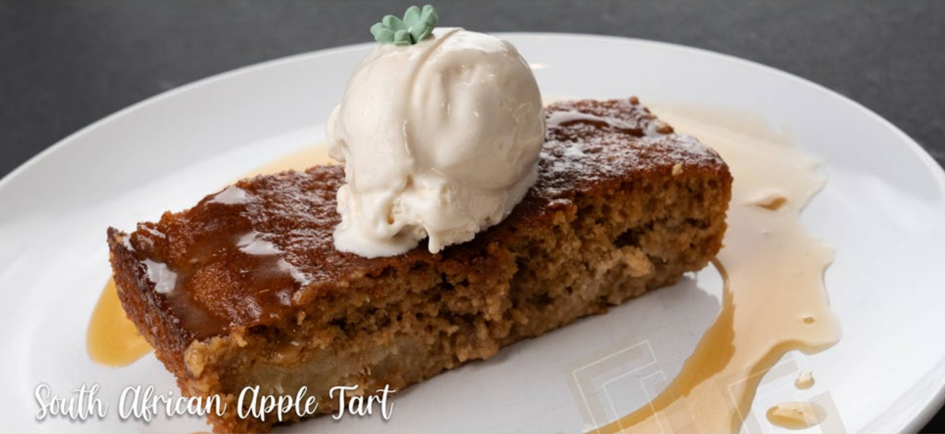
South African Apple Tart