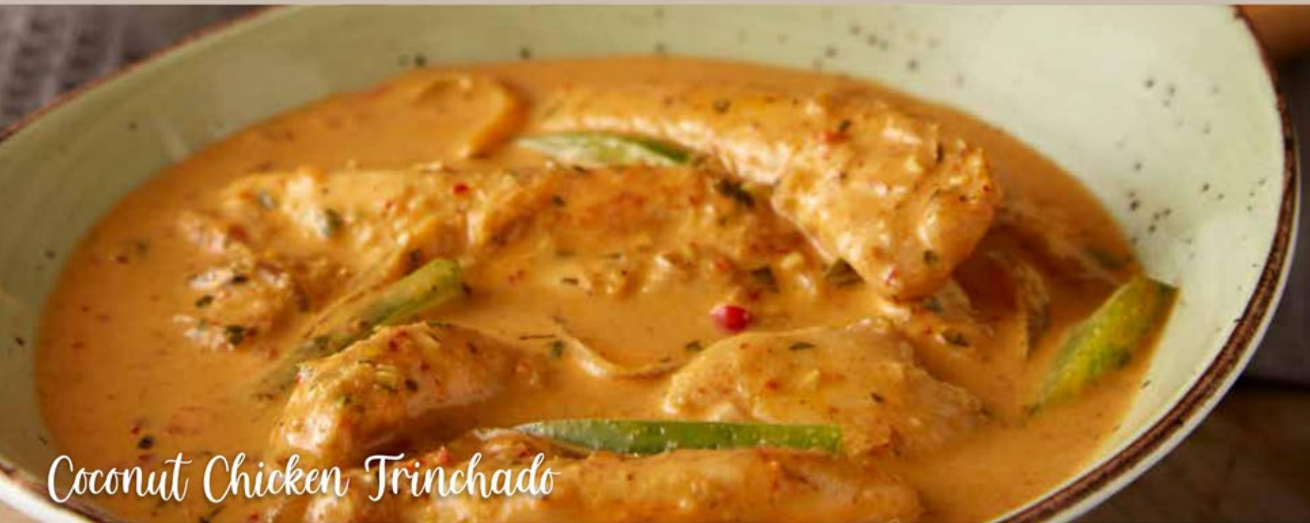
Coconut Chicken Trinchado