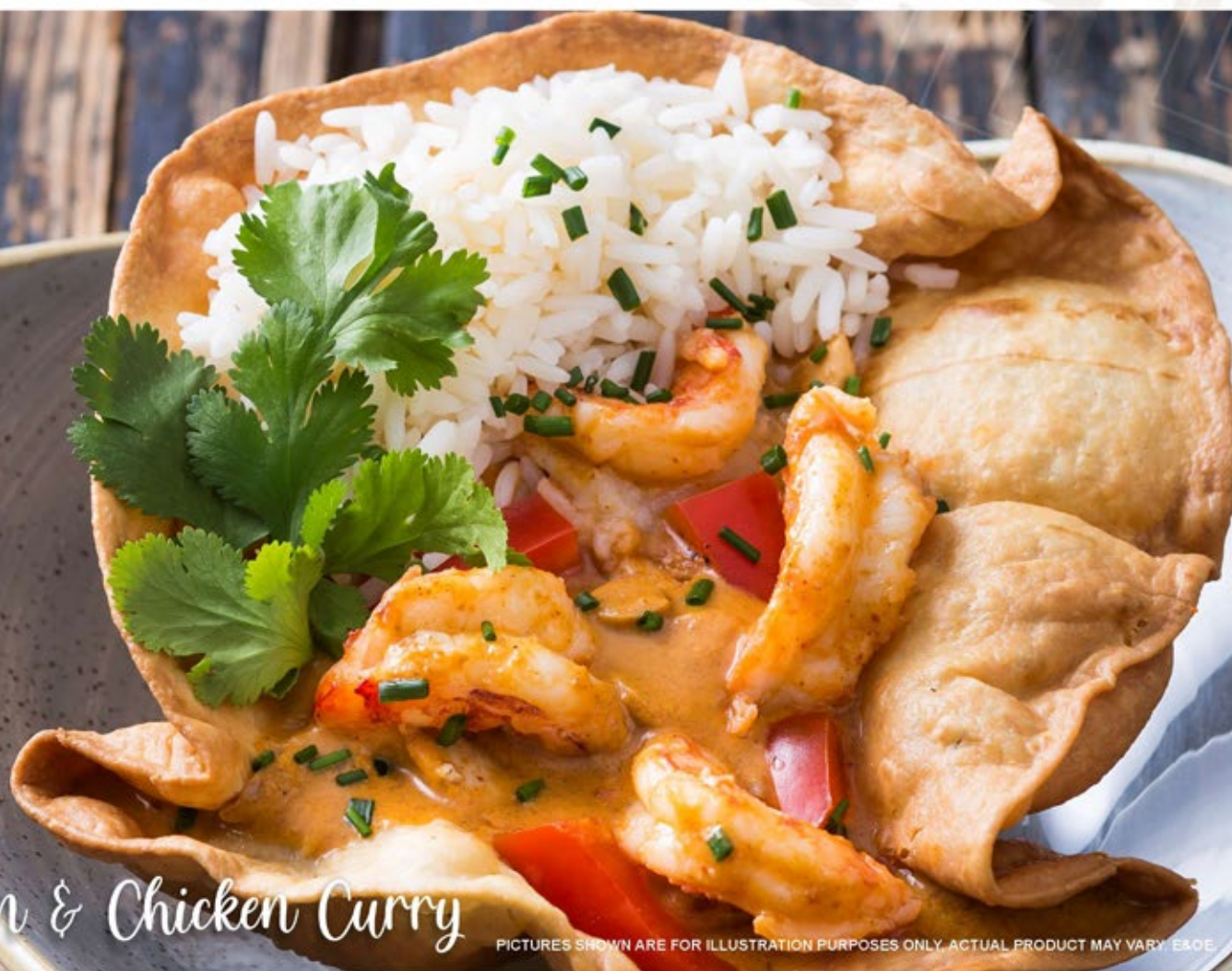
Prawn & Chicken Curry

200g Sirloin finished with sun-dried tomato and paprika butter. Served with avocado, prawns and chips.